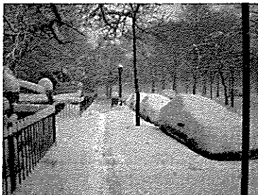
http://en.wikipedia.org/wiki/File:Prospect_Highway_Beyond_MTC_2-12-06.jpg Autor: nyctanlar, license Creative Commons, BY-SA